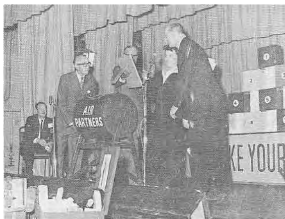
Michael Miles and his 'Take Your Pick' team.

At the time of writing we are preparing to leave for Gibraltar and the Mediterranean. We are due to spend a few days in Gibraltar, Malta and Marseille. Flag Officer, Aircraft Carriers, will be carrying out his inspection of the ship. It looks as if we are in for a concentrated 6 weeks activity, before we return to Portsmouth for our Christmas at home. The programme for early 1960 has not been finalised yet. All that is known is that this eventful commission will end at the end of February. Our good wishes go to those who follow after us in this great ship.