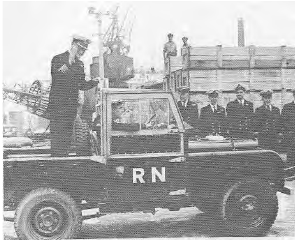
Captain Coke leaving