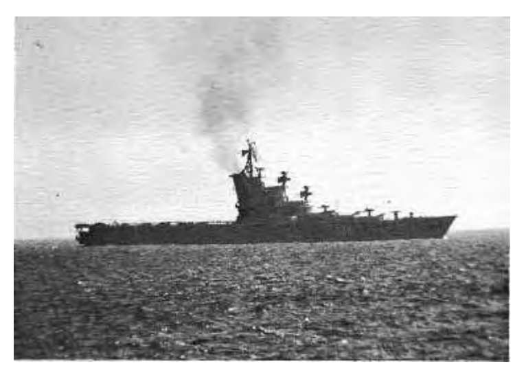
The Leningrad, one of Russia's two guided missile equipped helicopter carriers.