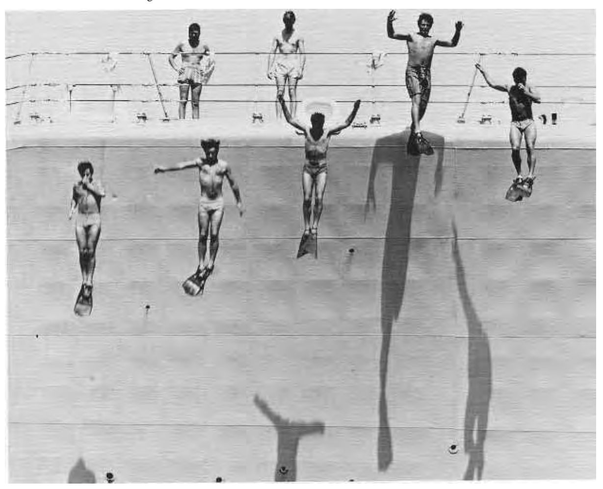
Swim Call on AURORA.