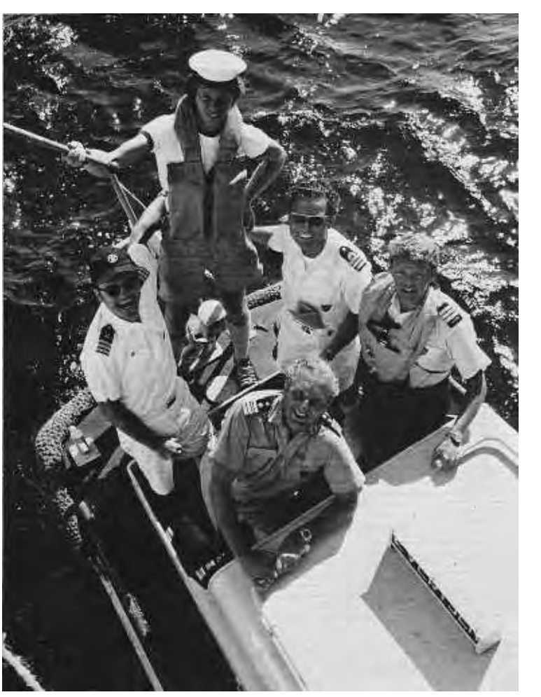
The C.O.s gather for a meeting at sea.