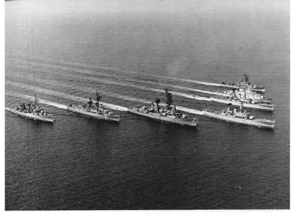
The ships of Standing Naval Force quickly became masters of the art of the "PHOTEX", or photo exercise.

During the passage to Izmir we were joined by the Greek and Turkish destroyers, HS THEMISTOCLES and TCG IZMIR.