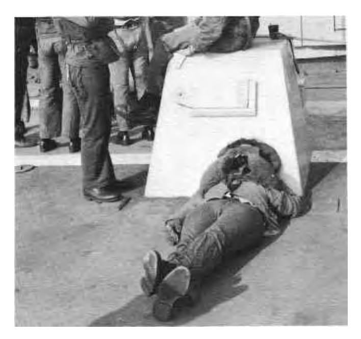
Taking a break after a hard RAS.