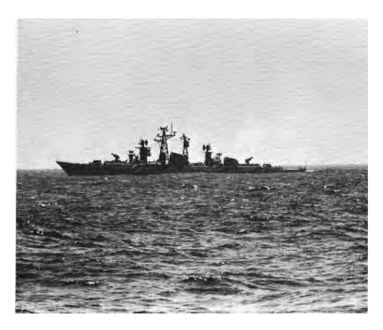
A Kashin class guided missile destroyer

The Standing Naval Force occasionally encountered Russian Fleet units.