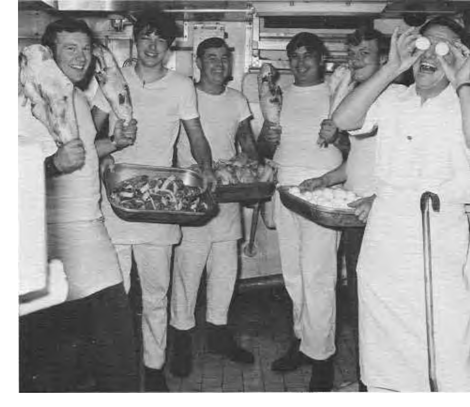
AURORA's galley crew hard at work.