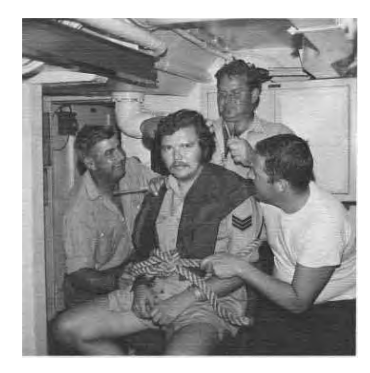
An American SUNEX's on BRAUNSCHWEIG.

A Dutch P.O. offers to accept anything but a brush cut from his Canadian hosts.