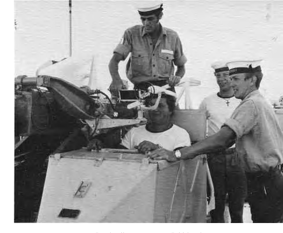
Dutch sailors try out some British ordnance.