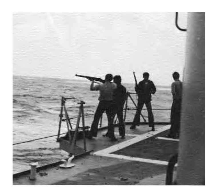
ADAMS sailors take careful aim at the Atlantic Ocean.