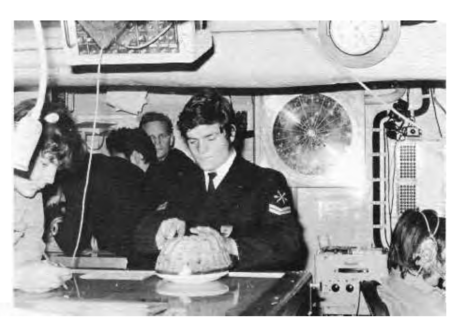
A birthday celebration in EVERTSEN's Ops Room.