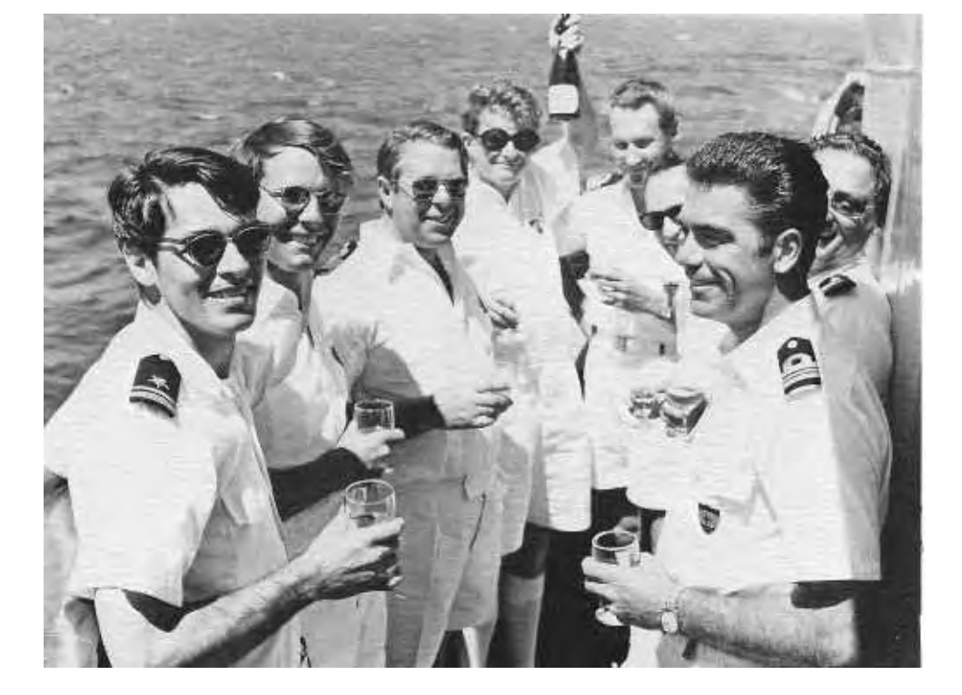
SNF Staff celebrates the Commodore's birthday. He's 44\, but looks 28.\,