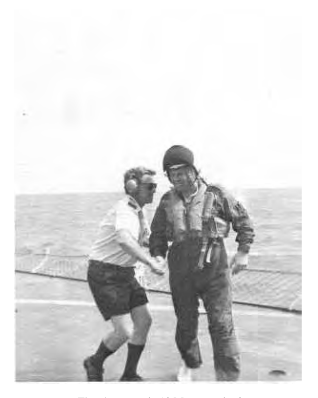
There's a party in 12 Mess, coming?