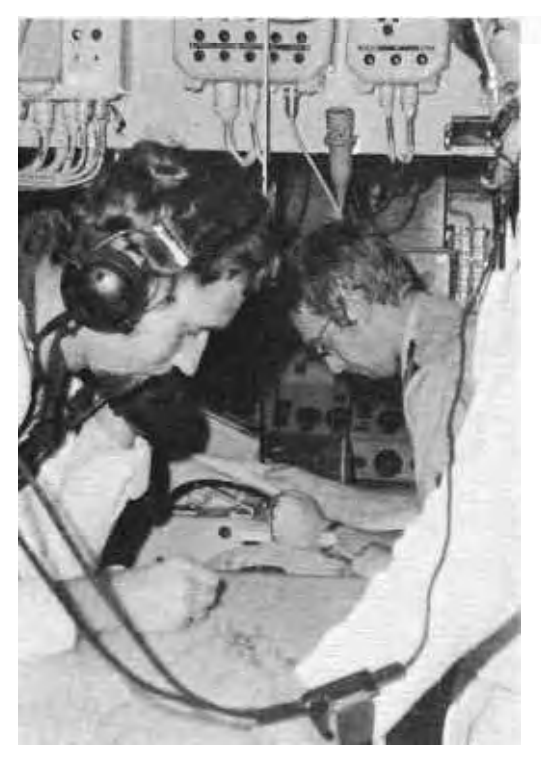
Plotting a track on BRAUNSCHWEIG.