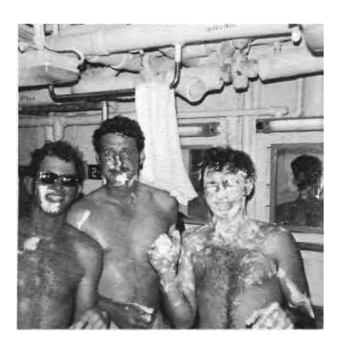
The guy with soap in his eyes started it.