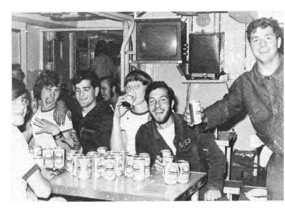
A quiet evening on EVERTSEN