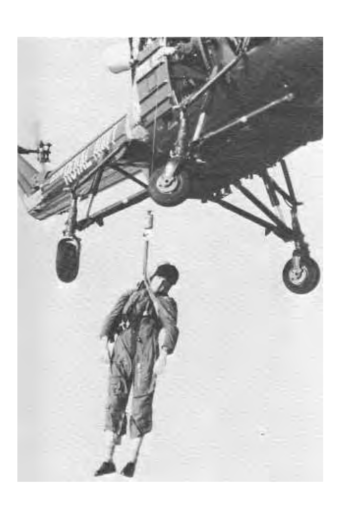
ADAMS' XO thought he heard liberty call.