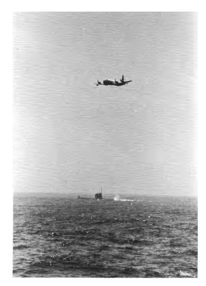
A US patrol aircraft flies over a Foxtrot class sub