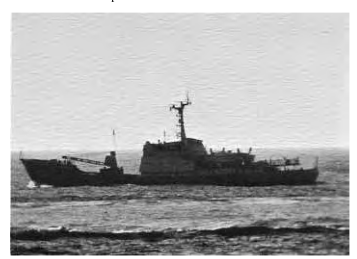
A Russian "trawler"