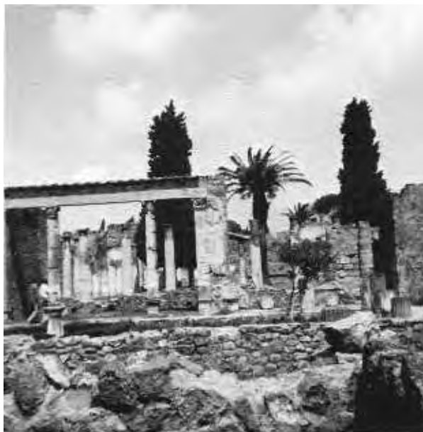
The ruins of the City of Pompeii