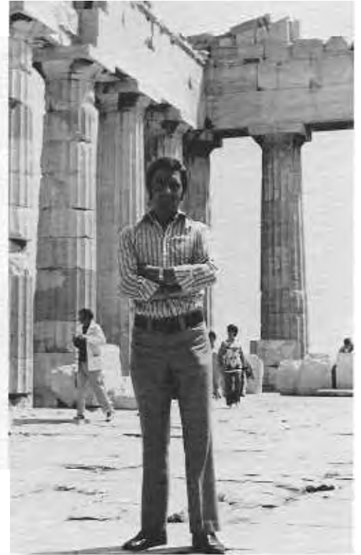
Our fearless staff photographer takes this chance to get his own picture in the book.

No trip into the Mediterranean would be complete without a visit to one of the oldest and most famous cities in the world, Athens, Greece. The places which the men of Standing Naval Force had the opportunity to visit; the city of Athens and the countryside of Greece, the Temple of Zeus and the Acropolis, are sights most people only dream of ever seeing.