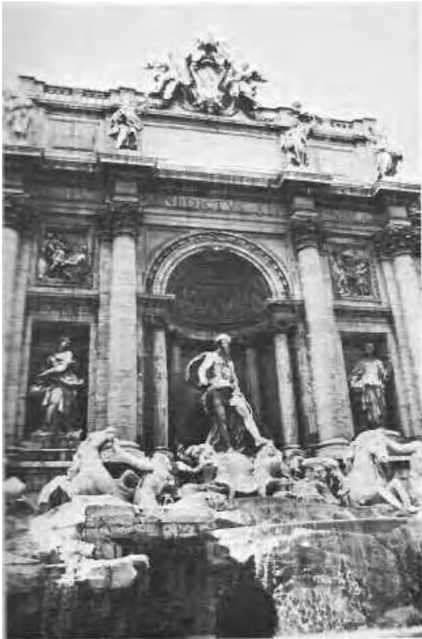
The Fountain of Trevi