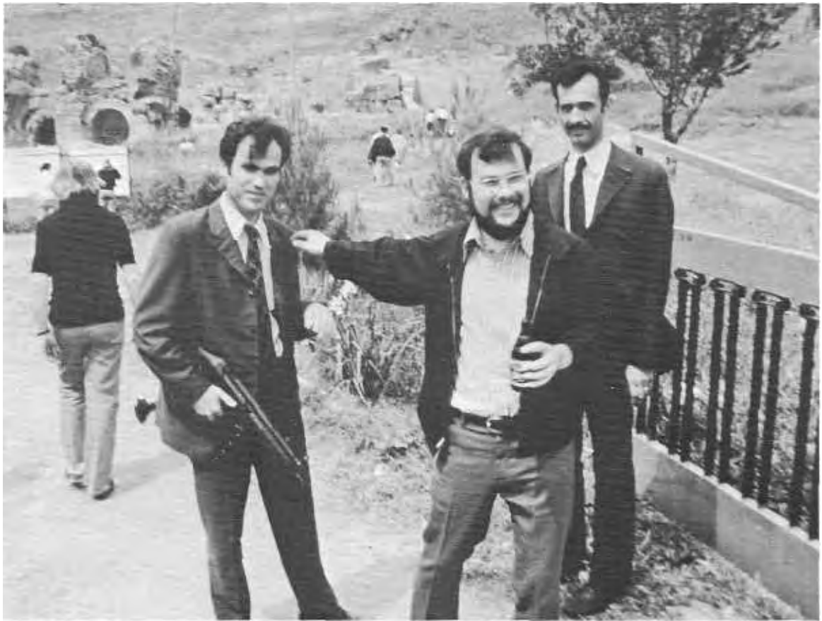
When ADAMS sailors toured Ephesus they found themselves accompanied by two very amiable bodyguards, one of whom carried a very businesslike-looking sub-machine gun.