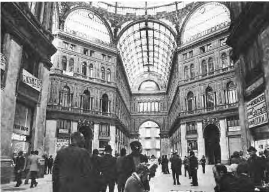
The Covered Marketplace in central Naples.

The SNF sailors who spent their time in Naples found that the area offers many places to visit and things to see.