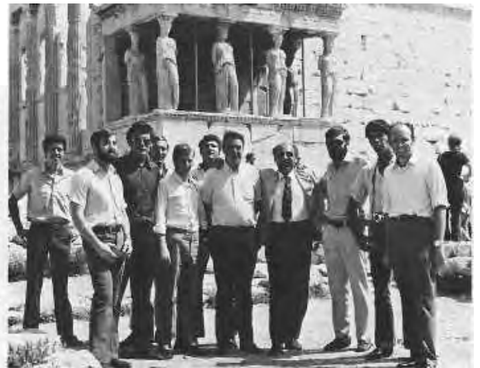
A tour from AURORA