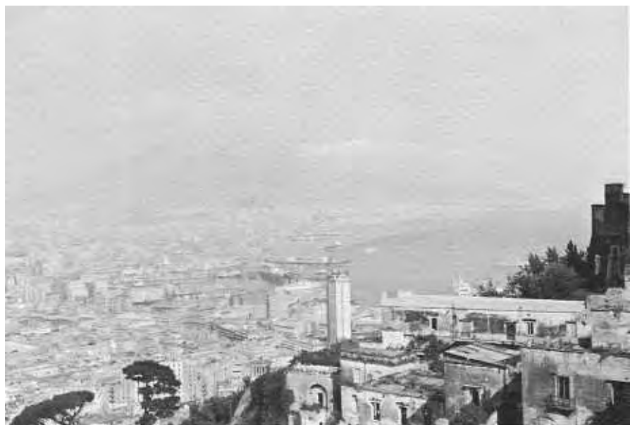
Overlooking Naples harbor toward Mount Vesuvius.

DO YOU SUPPOSE WE MIGHT HAVE FOULED THEIR ANCHOR CHAINS?