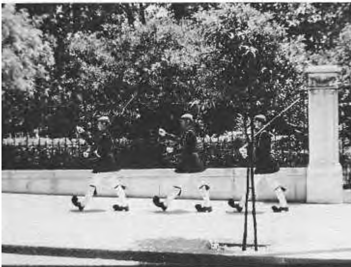
The changing of the Palace Guard.