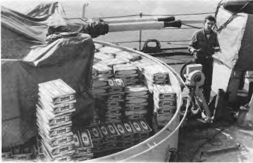
EVERTSEN's supply Ship arrives from the Netherlands with a vital cargo.