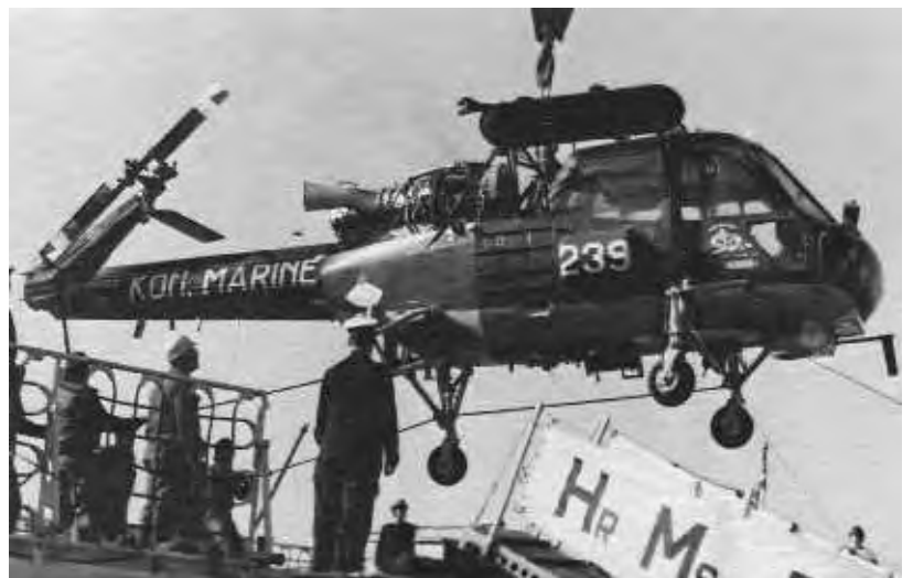
Pony airborne port.