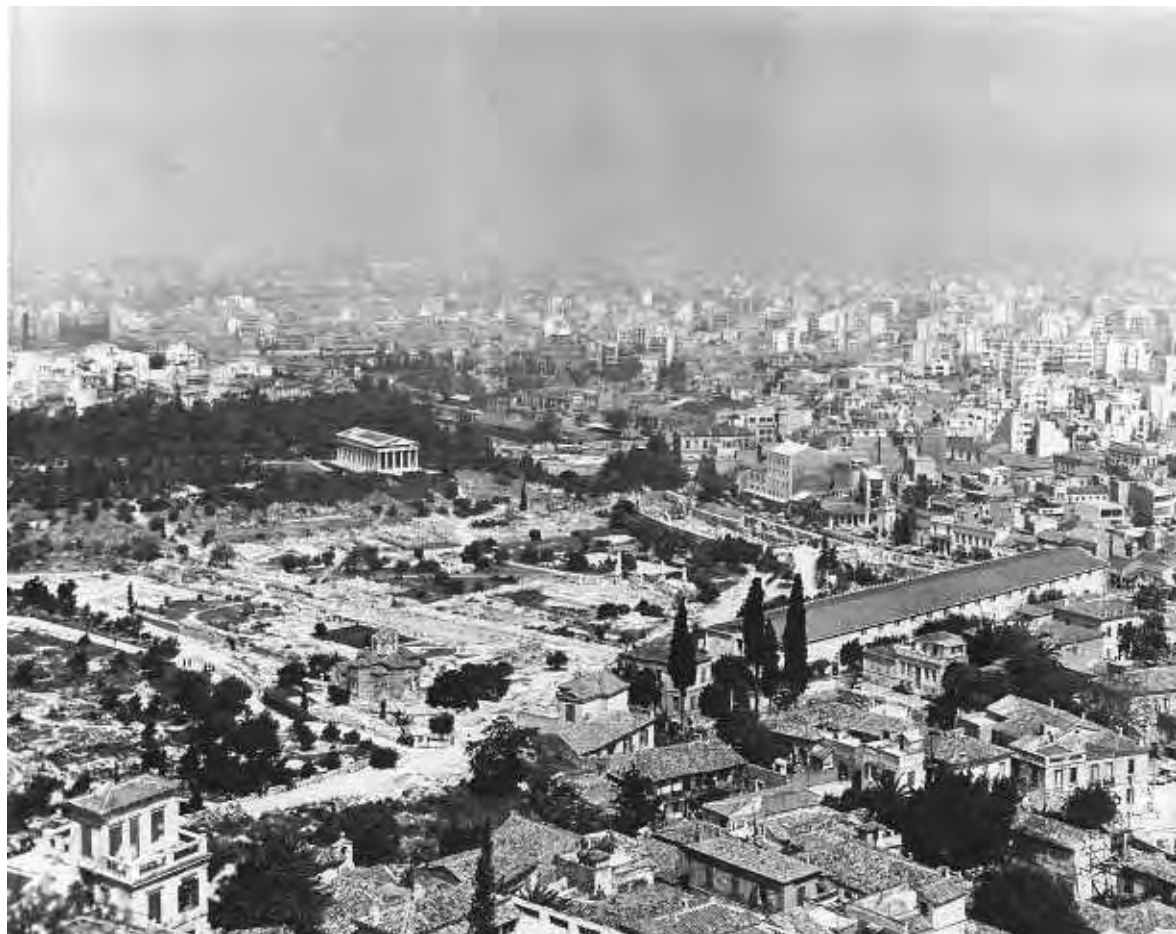
The Old amidst the New; The Temple of Zeus near downtown Athens.