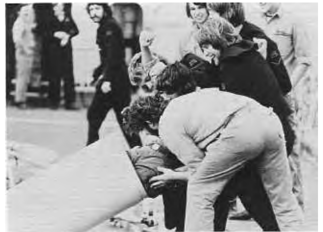
An unusual projectile for the ASW mortar.