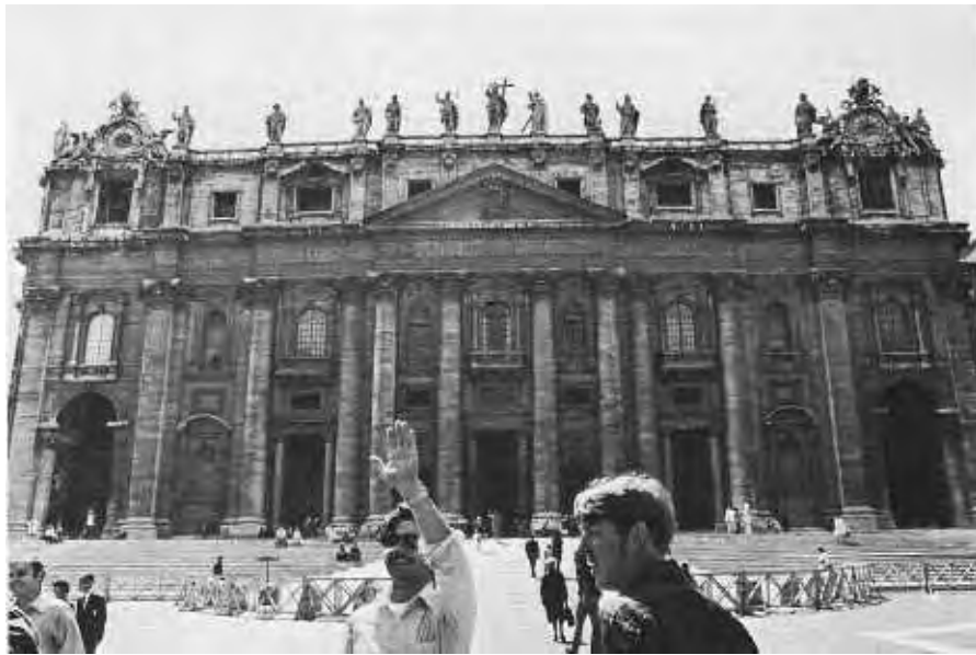
Saint Peter's Basilica