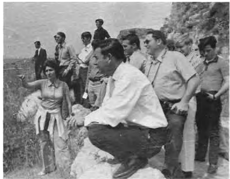
Our tour guide at Ephesus was Miss "Bus Number Two".