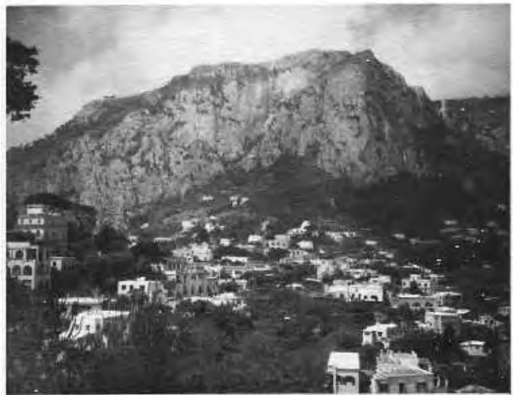
The Isle of Capri

The SNF sailors who spent their time in Naples found that the area offers many places to visit and things to see.