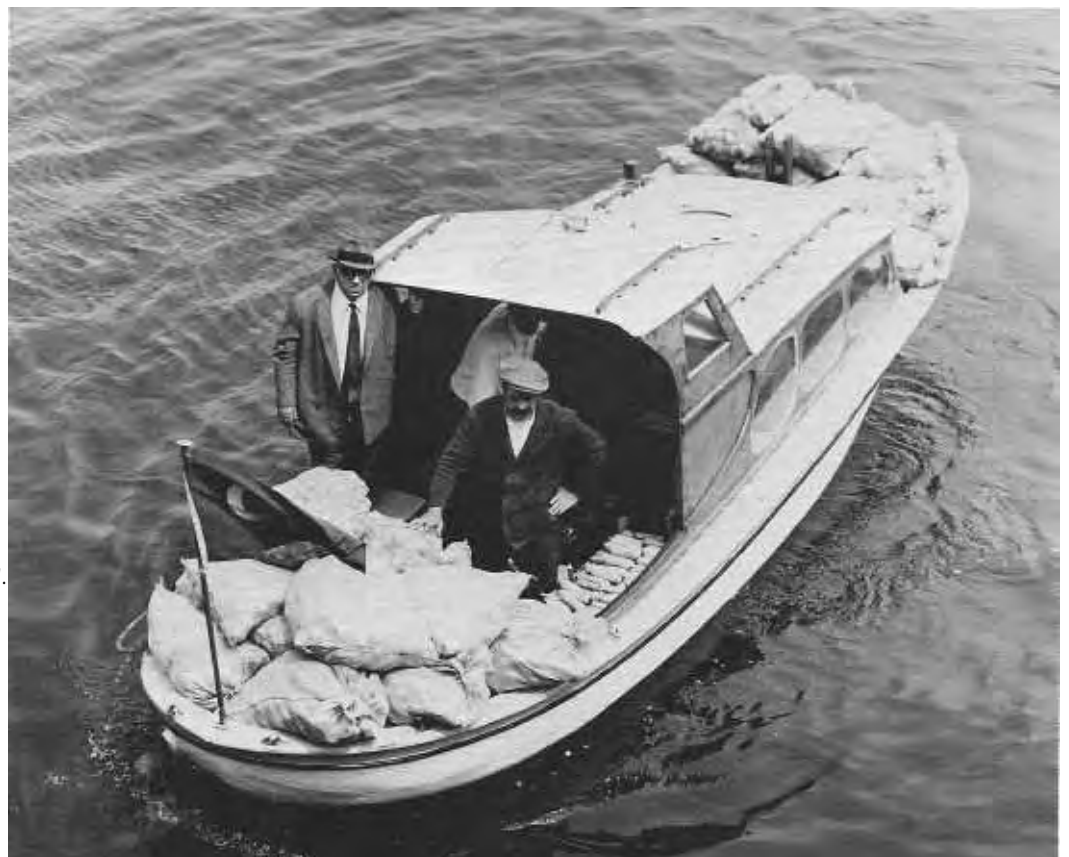
An Izmir "Delivery Van".

Izmir, Turkey was the easternmost port visited by the Standing Naval Force. The unique character of this ancient city, with its shopping bazaars, mosques, and many sidewalk cafes made it a fascinating place to visit. The many SNF sailors who visited the nearby ruins of Ephesus and Sardis found themselves literally walking through the pages of biblical history.