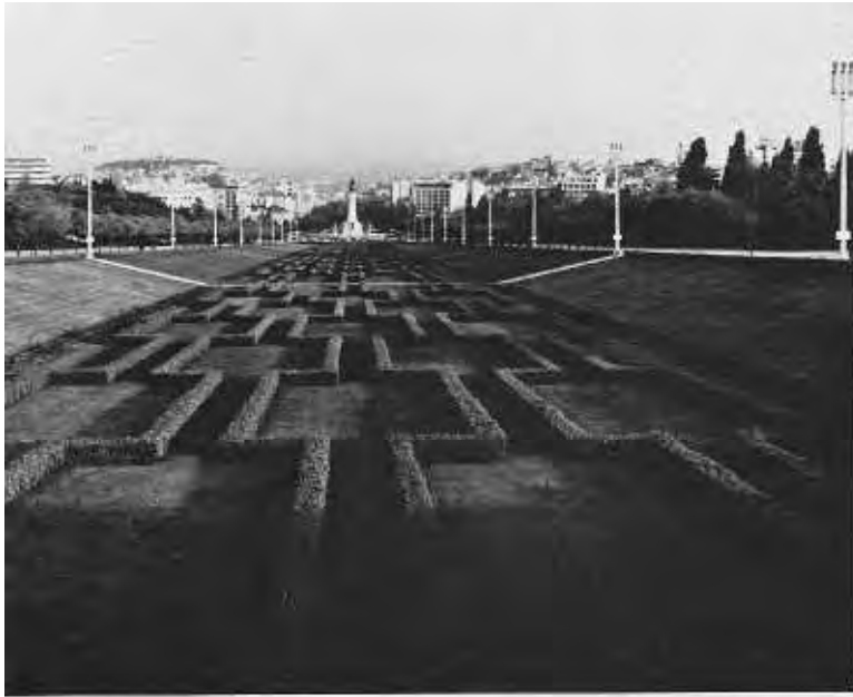
Common sights in Lisbon for the men of Standing Naval Force.