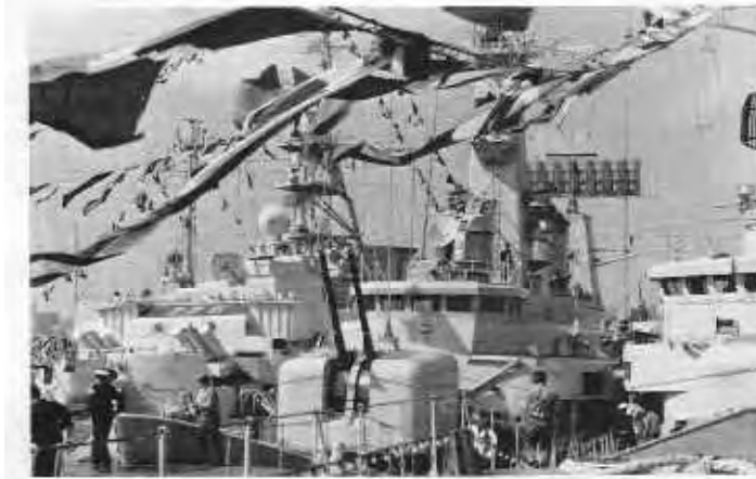
The Queen's birthday.