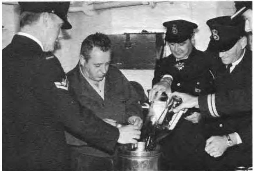
Everyone gets into the act