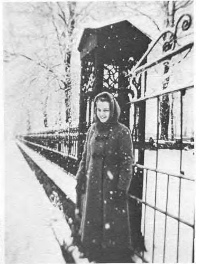
One American navyman thought this was the most beautiful sight in Halifax.