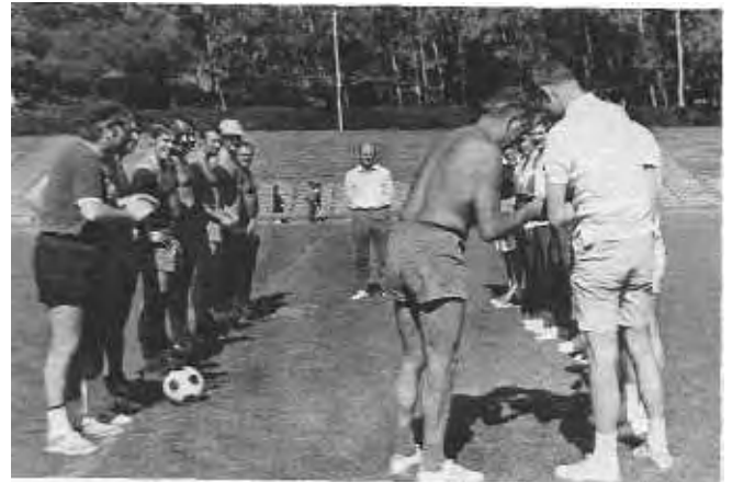
BRAUNSCHWEIG and ADAMS officers square off for a soccer match.