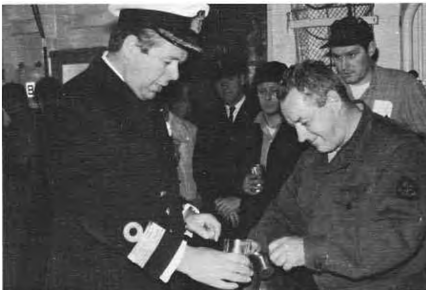
The Commodore considers it his duty to be present at all important military functions.