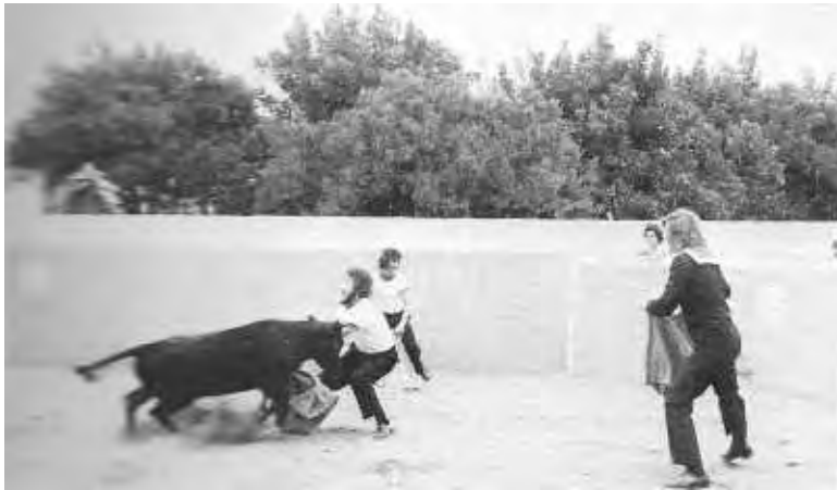
A few examples of how the men of SNF spent their leisure time in Lisbon.