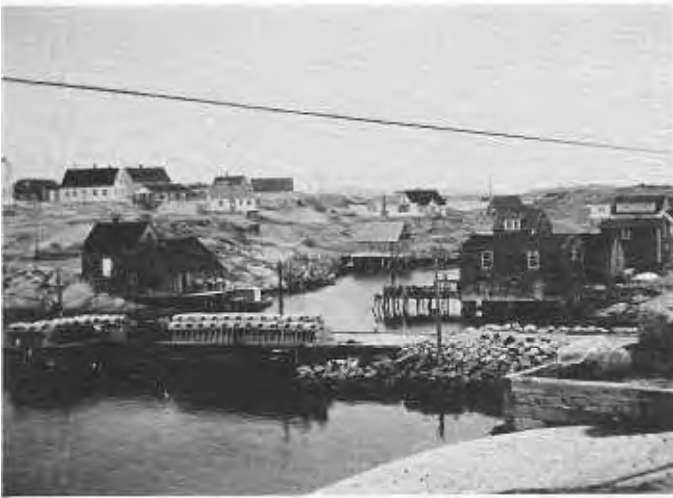
Picturesque Peggy's Cove.