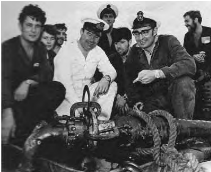
A truly Universal NATO fuel coupling.

As SKEENA departed we were joined by the Portuguese frigate, PNS ADMIRANTE PEREIRA DA SILVA.