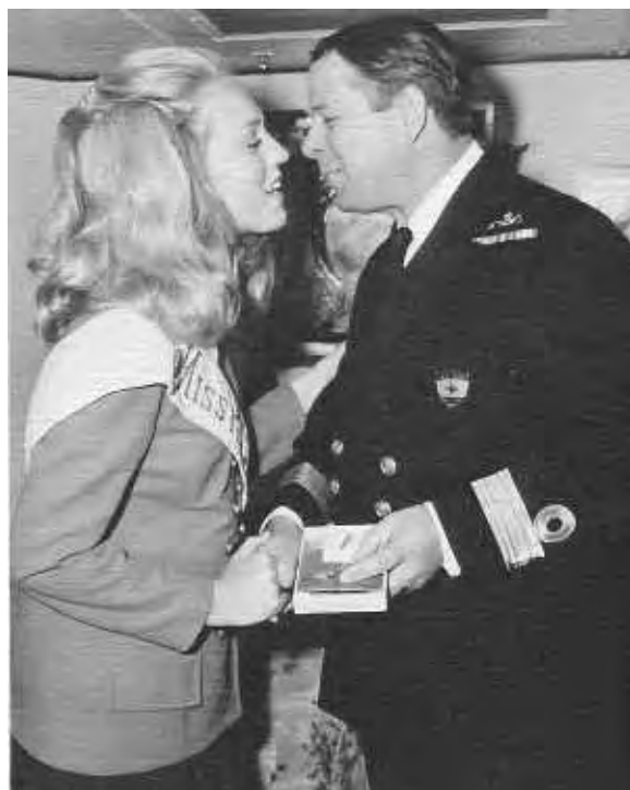
There still are some perks to being Commodore.

The twentieth anniversary of the NATO Allied Command Atlantic, headquartered in Norfolk, Virginia, was the occasion for an official visit of Standing Naval Force Atlantic to that city. At the Twentieth Anniversary Ceremony at SACLANT headquarters military leaders from every NATO nation were in attendance.