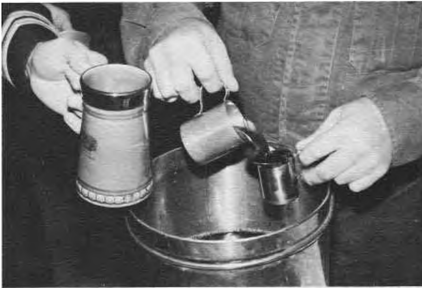
On 31 March, 1972 a long standing custom in the Canadian Navy was observed for the final time. This was the last day of the Rum tot and the occasion was marked with all due solemnity and ceremony.