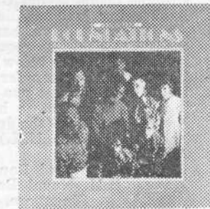
FROM THE FOUNDATIONS (NSPL 18026)