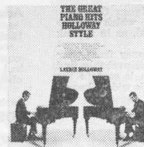
THE GREATEST PIANO Hits Holloway Style (NSPL 18188)