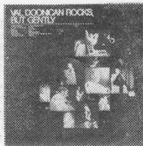
VAL DOONICAN ROCKS But Gently (NPL 18204)