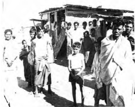
.... and villages ....