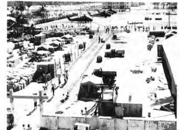
. . . . from Patuakhali . . . .