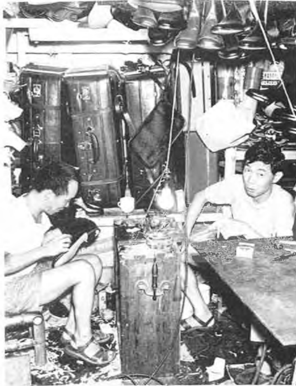
Ship's shoe factory