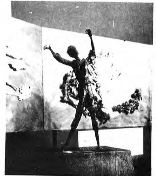
Inside the Peace museum