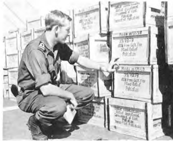
. . . world wide aid . . . .