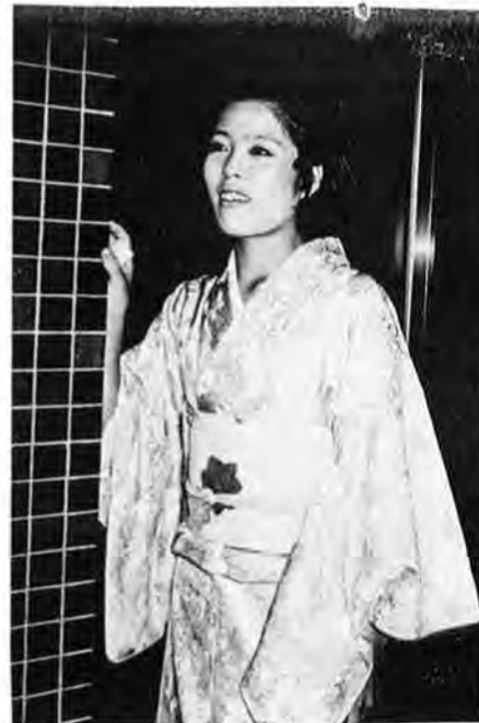
Open to Visitors