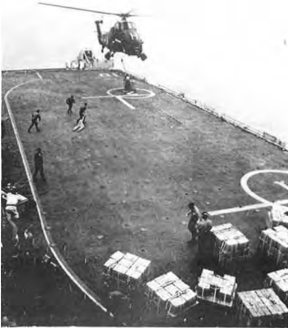
Flying ashore . . . .

Anchored in the Bay of Bengal she was constantly sending food, clothing, and medical supplies from HMS TRIUMPH and herself to locations ashore, where they were distributed to isolated islands in the Ganges Delta by her LCVP's and LCM's. In addition to the large number of assault boats and helicopters that were taken on by us for the operation,