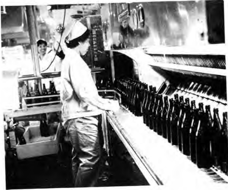
Manufacturers . . . .