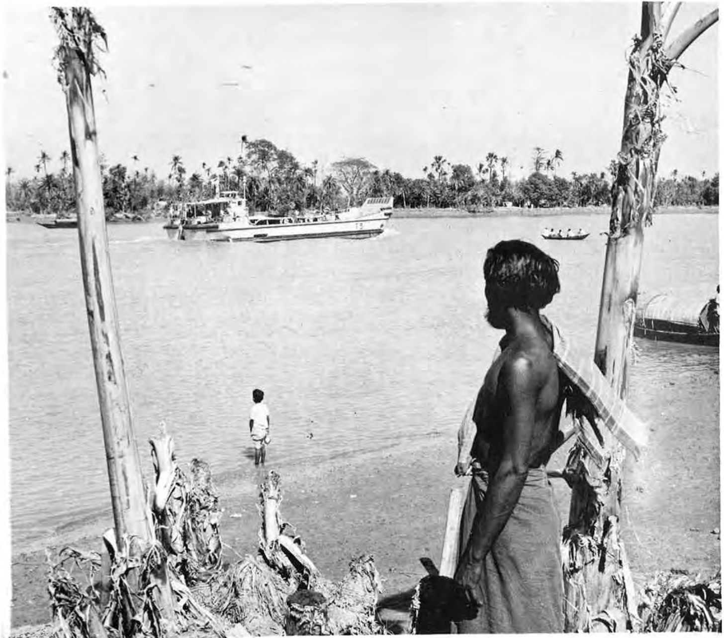
.... in the Ganges Delta