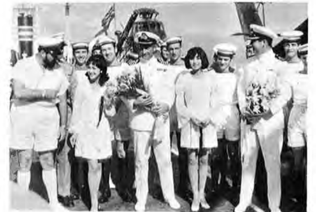
"Etchings dear, Etchings"