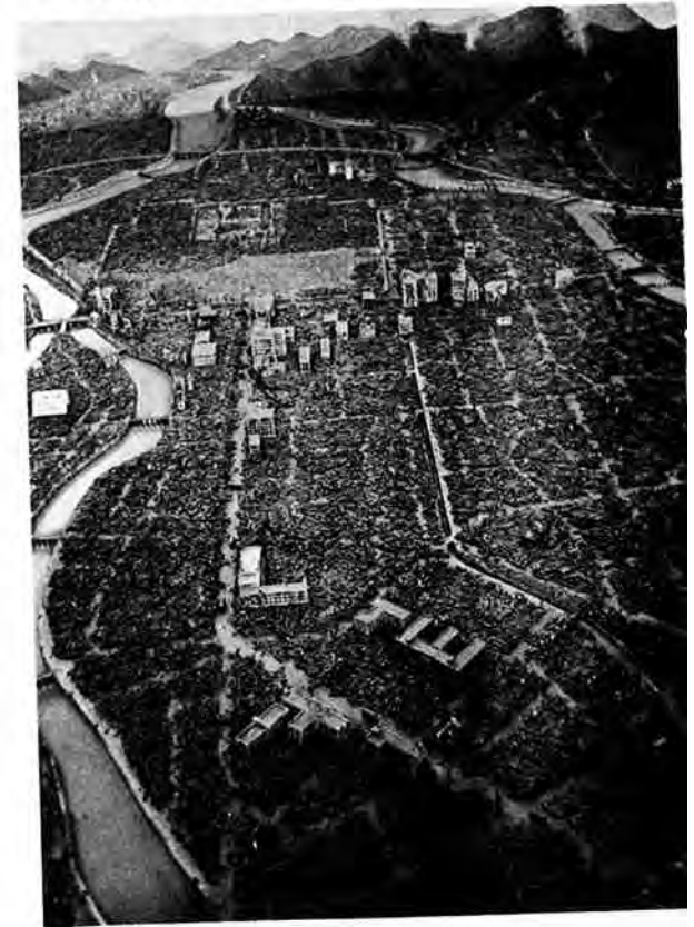
Model of Bomb's Destruction