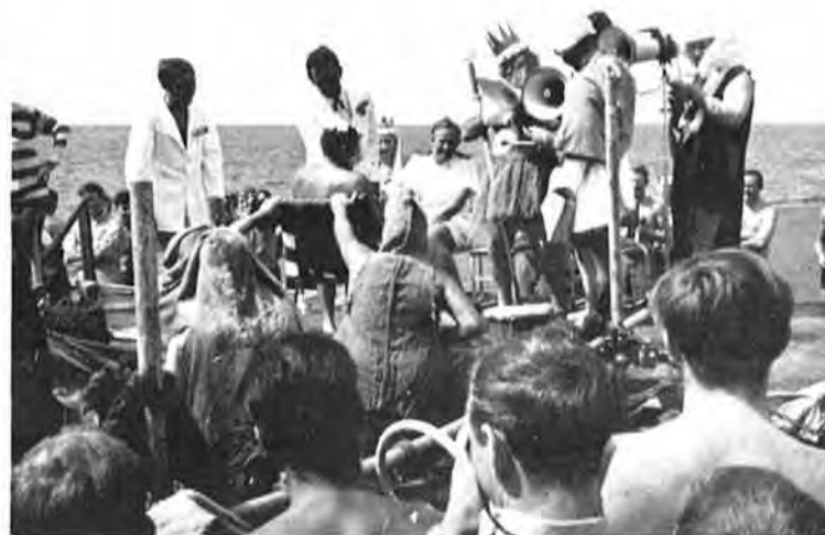
Crossing the Line