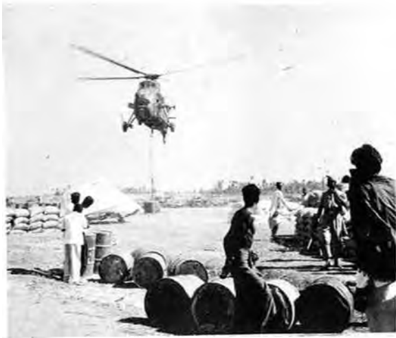
.... to remote areas ....