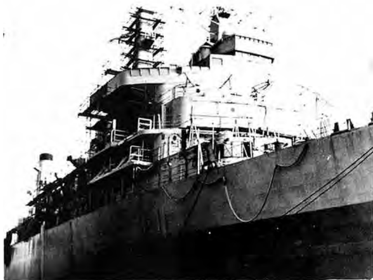
In Dockyard Hands