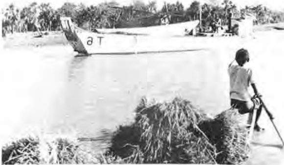
. . . . for "daily delivery service" by LCVP . . . .