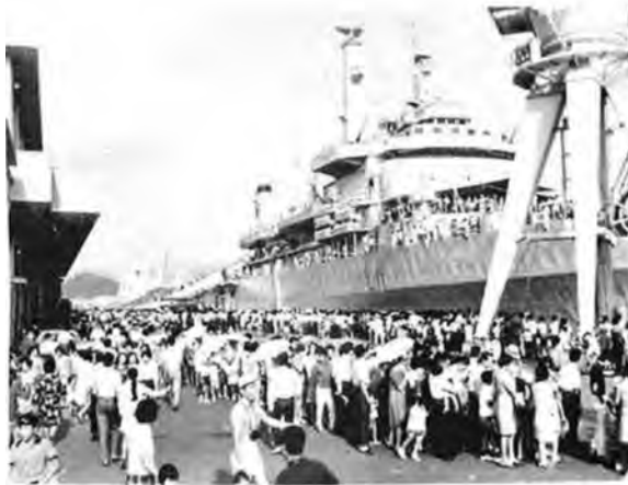
Open to visitors