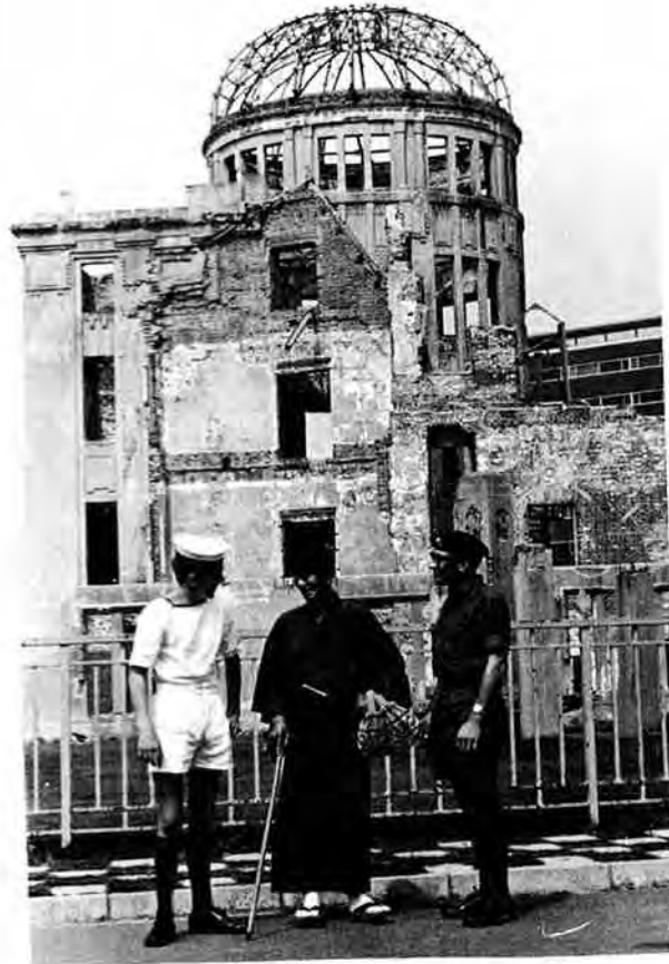
Centre of the explosion