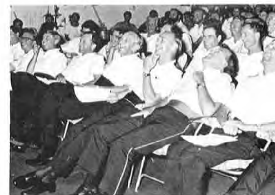
"I never thought he'd do it"