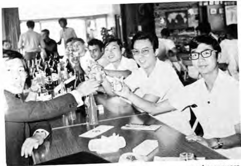
. . . . and consumers