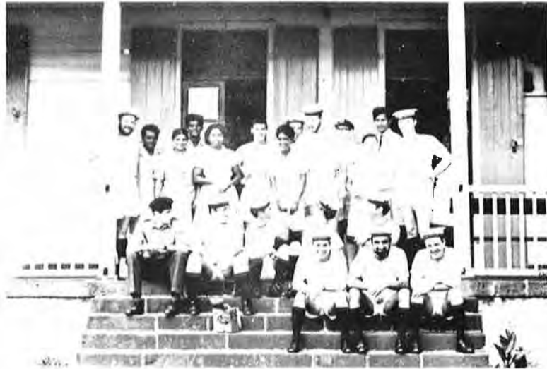
Ship's blood donors in Mauritius