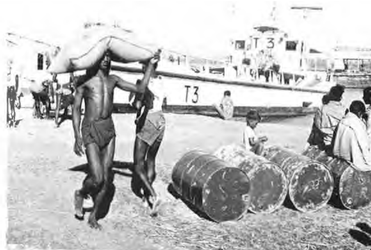
. . . . and LCM's . . . .