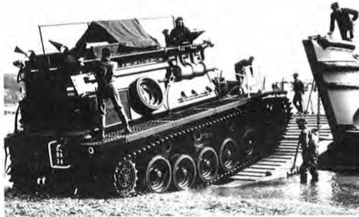
BARY (Beach Armoured Recovery Vehicle) embarking on LCM