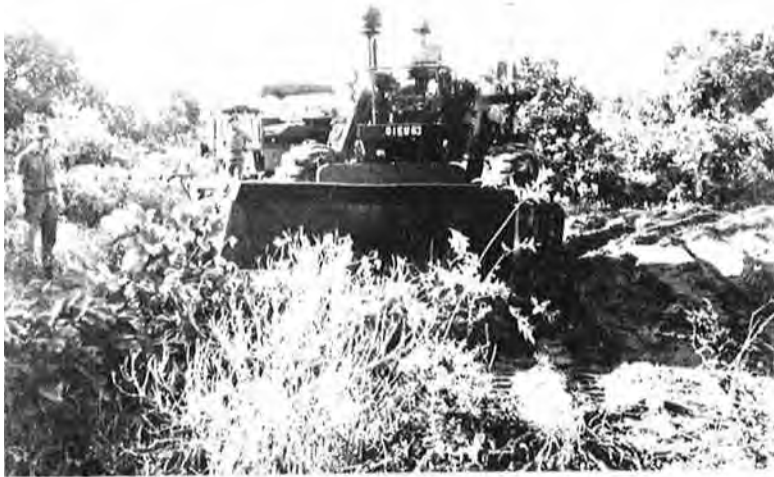
A Michigan clearing beach units camp area