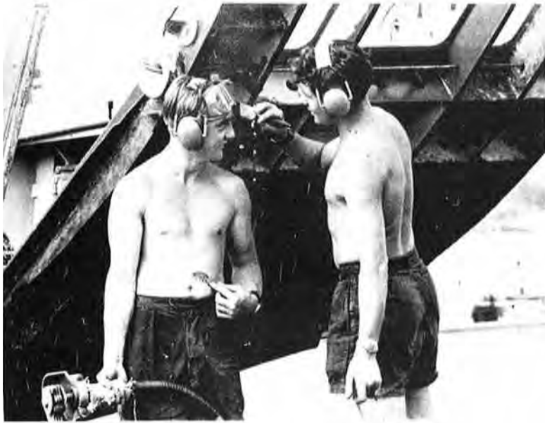
"Will that eye shadow match my birth mark"