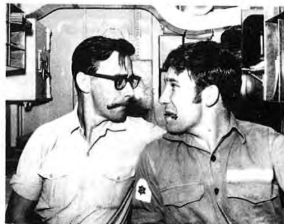
Just good pens