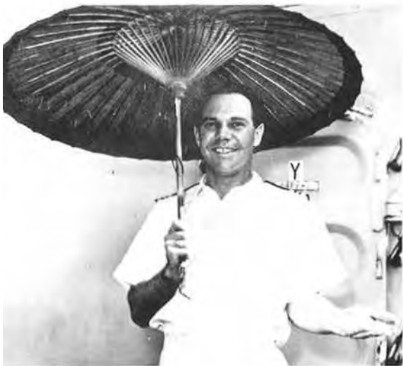
"But I'm sure I forecast rain"