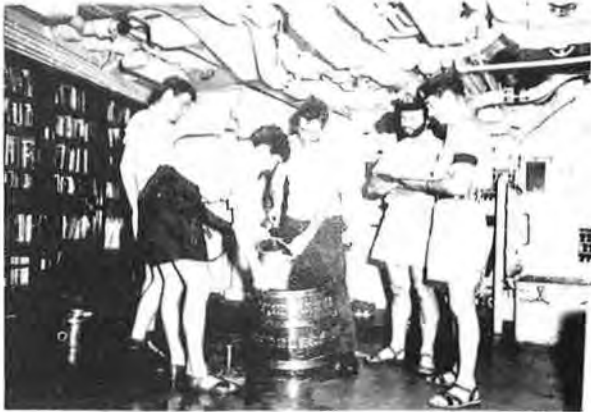
"Anyone for Limers?"

Our photographer unfortunately wasn't present at the first issue, though we did manage to get him along to the last.