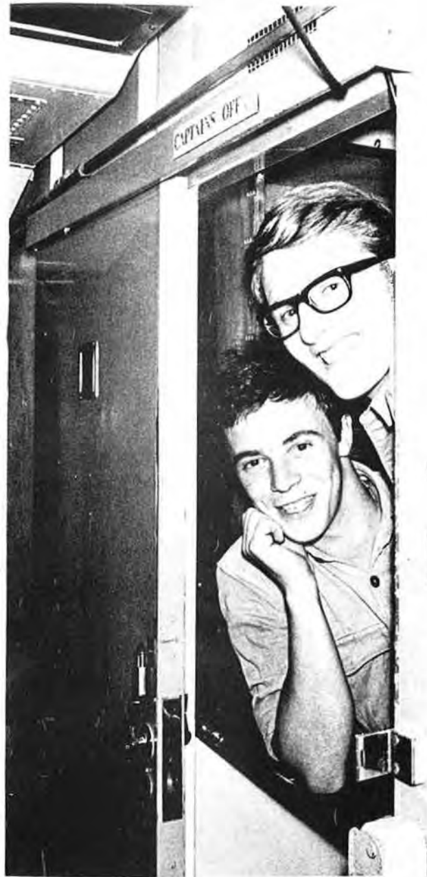
It's amazing what you can do in a small space if you really try

Hong Kong, the playhouse of the East., It seems to turn man into beast. With good intentions all begin But once ashore, fall into sin. The girls parading are a sight Each har and building bathed in light It seems that this place nothing lacks Or ' twould appear to roaming 'Jacks' . Next day, with heads as sore can be It' s straight to doe 'Oh please help me' A 'rosy dawn' to clear the brain we' re fit to go ashore again, For anyone with nougat to do Swallows' will do a good tattoo You laugh, and say 'An O. D. s run' Hear what a Leading Writer' s done??? Just this... and now, though you may scoff Will this incur his lady' s wrath? Depends if his wife plays the game At least he' s inscribed with HER name! ! ! But now he' s got upon his arm A coloured picture full of charm But in the office, please, perhaps You' ll keep the peace... DON'T CALL HIM `TATTS' Titus Hell