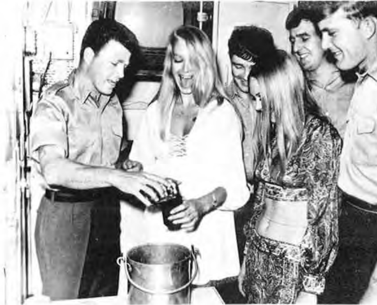
It's a man's life in the Royal Marines