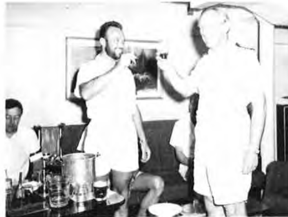
Every man has his price