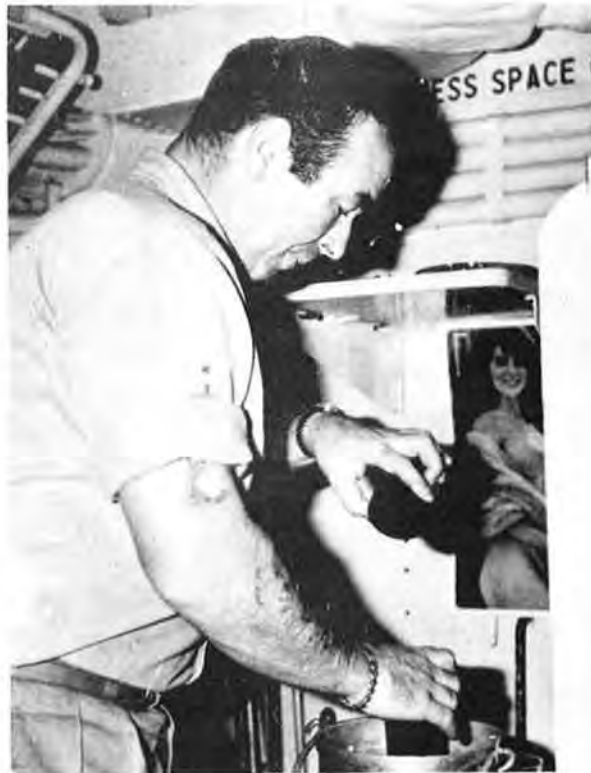
The very last drops