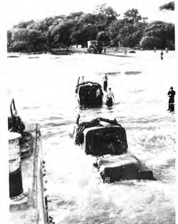
A wet Landing