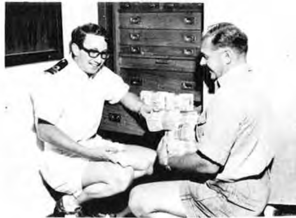
"And you make all this yourself?"