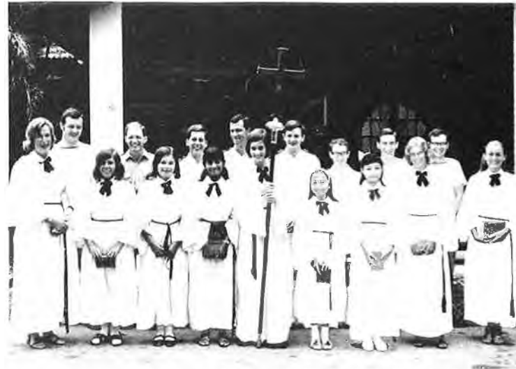
Some of Intrepid's Choir at St. Peter's, Singapore

This is one department which does not publish statistics, but we can say that a daily Communion has been established and that Sunday worship has been greatly enhanced by the strong harmonies of the Intrepid Choir - directed by the Dental Officer and organised by the PMO. Four candidates have been confirmed, and one person baptised in Singapore Cathedral. Visits have been well supported and have included the Hong Kong hospital for lepers, the Home of Loving Faithfulness for Spastics, and also in England we visited the home of the Franciscans at Cerne Abbas. We have had strong ties with many Churches throughout the world and especially with the Parish of St Christopher in Johore.