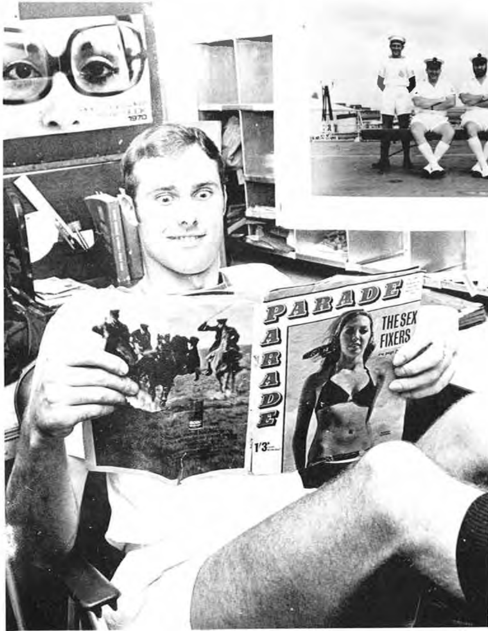
Fe-male is now ready for collection