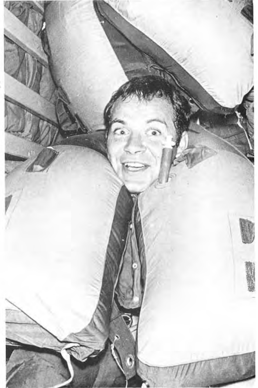
The life jacket king