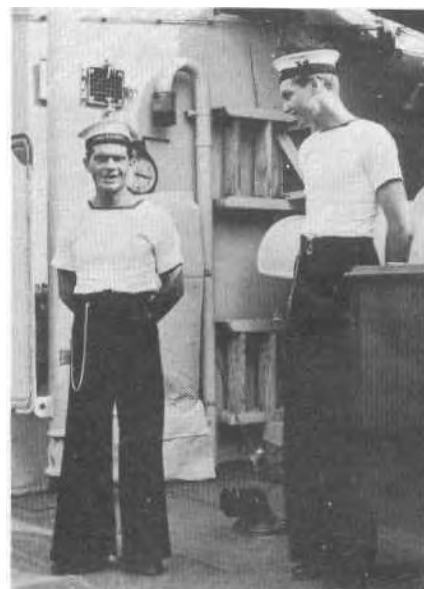
Take a more searching look at our 6'4" sailor