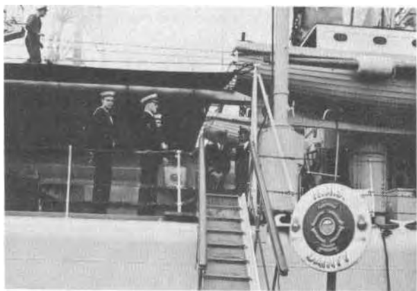
Come over the gangway