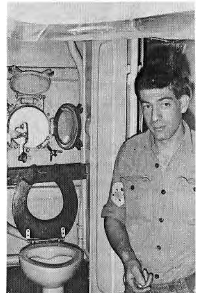
Two are better than one.