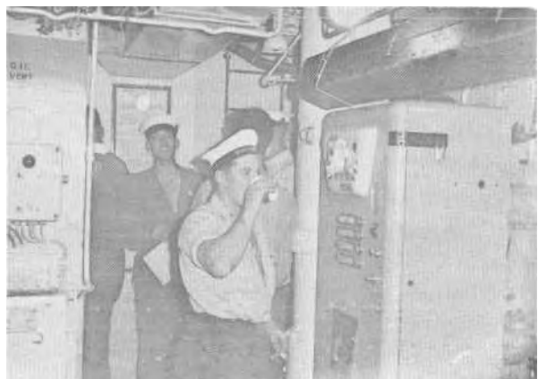
I'll try anything once