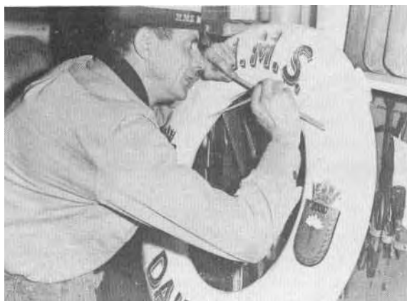
The Old Man of D.C. in his lair.