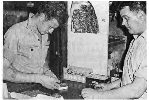
What price duty paid?