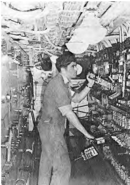
Power at his fingertips.