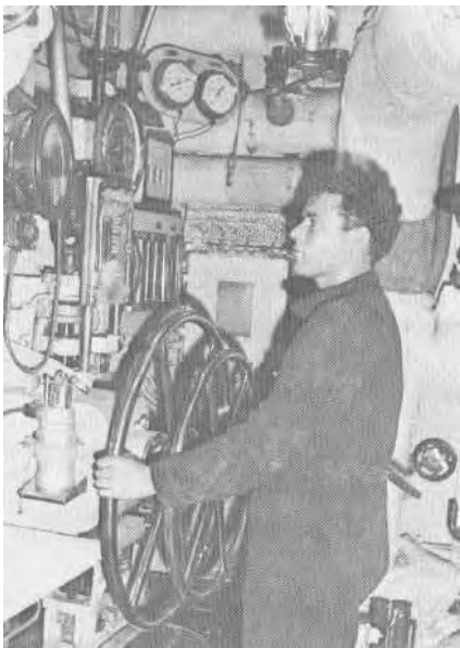
One machine can do the work of fifty ordinary men. NO machine can do the work of one extraordinary man.