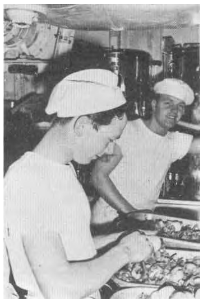
Man cannot live by bread alone.