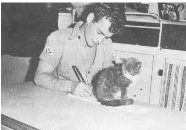
I'll tell you a tail.