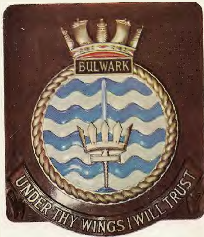
H.M.S. BULWARK 1957-1958