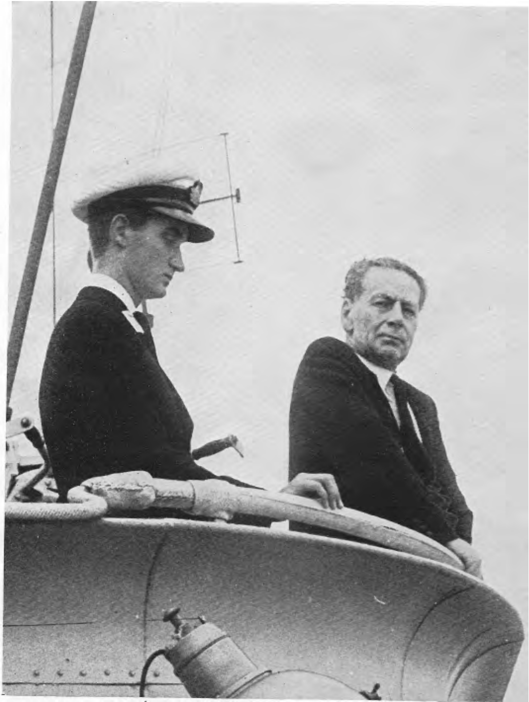
THE FIRST LORD' ON THE PILOTAGE POSITION