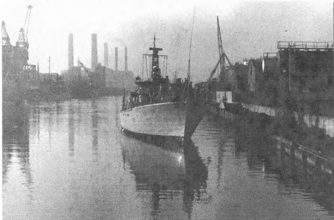
HMS AXFORD coming alongside in the 1950's. Shoreham Power Station in background