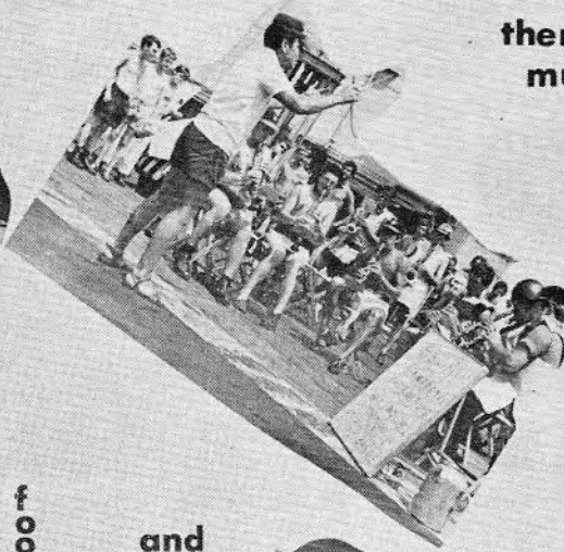
there was music