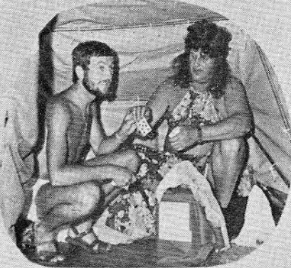
madame zsa zsa was duty forecaster