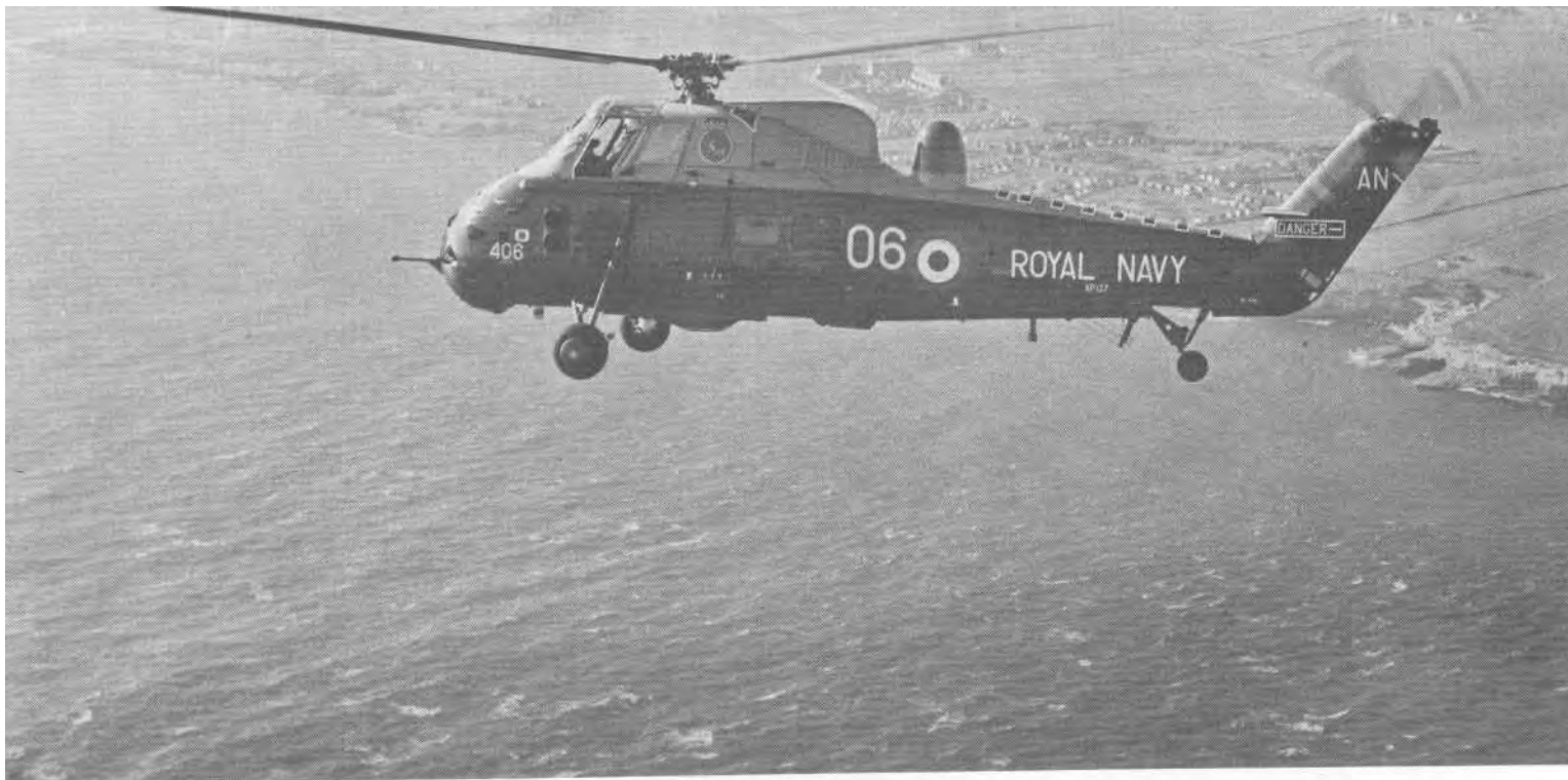
HMS ANTRIM' s Wessex III Helicopter airborne over Portland Bill April 1971