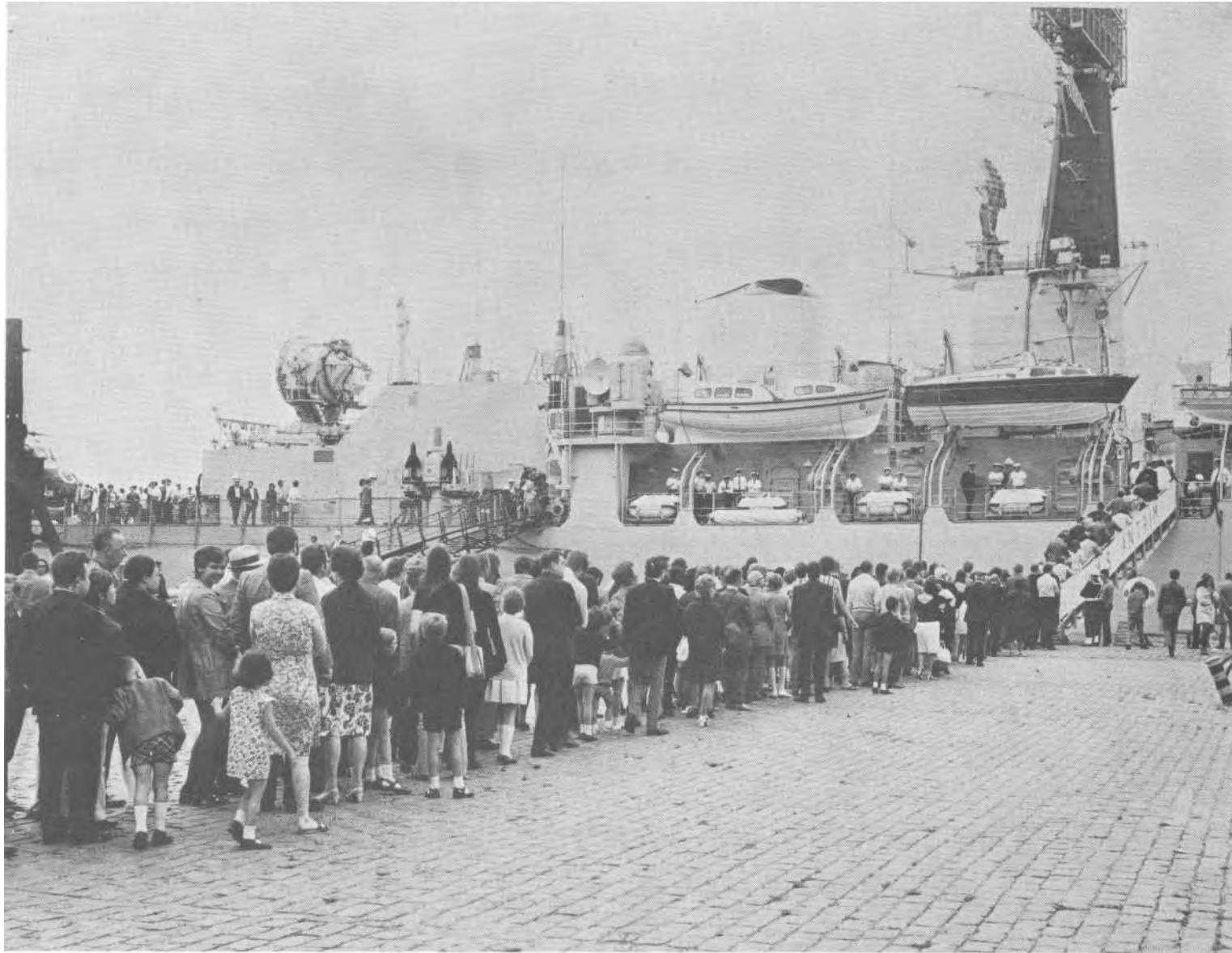
Antwerp, July 1971 - HMS ANTRIM open to visitors