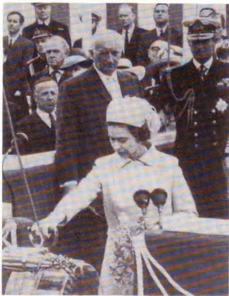
Her Majesty Queen Elizabeth accompanied by Prince Philip, launching the Royal Navy's first Type 42 guided missile destroyer at 12.30 p.m. on Thursday 10th June 1971.